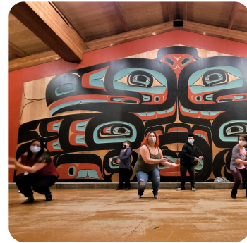
Photo on the Left: Gájaa Héen Dancers practice their song and dance skills.