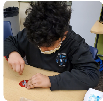
Photo on the right: A Gájaa Héen Dancer is working on a beading project for their fundraisers during their after school class.