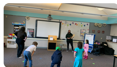
Photo on right: K-1 culture class students practice their song and dance skills.