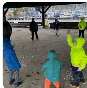
Photo on left: 2-5th grade culture class students took their learning outside during the month of February.