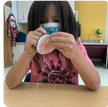
Photo on the Left: K-1 culture class students practiced beading edges on a flower pin