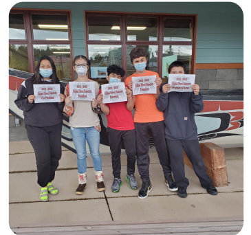
The G ájaa Héen Dancers elected members of the 2021-2022 executive committee stand proudly in their new role.