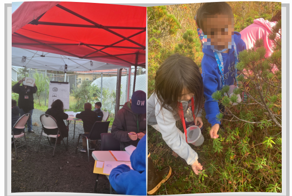
Photo on left: 2nd through 5th grades students brave the outdoors for art, song, and dance lessons